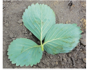
Nealta Miticide 13.7 oz/A